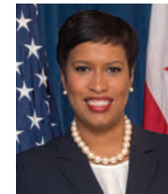
Muriel Bowser Mayor Washington, DC