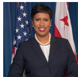
Muriel Bowser Mayor Washington, DC